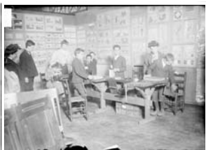
Grammar school children gathered around a table doing woodworking projects while teachers watch nearby in a classroom.

(Savich, C., 2008) "The purpose of this action research project was to investigate approaches and techniques that would improve critical thinking skills in history classes at the secondary level. The research methodology consisted in a comparison of the inquiry or interactive method of teaching history with the lecture method. The research results demonstrated that when critical thinking skills were emphasized under the inquiry method, students achieved higher scores on tests, quizzes, and assignments and gained a deeper and more meaningful understanding of history. Critical thinking skills were shown to be effective in achieving a more in-depth and meaningful understanding of history by high school students, but relied on the integration of the critical thinking skills with subject content and on student motivation."